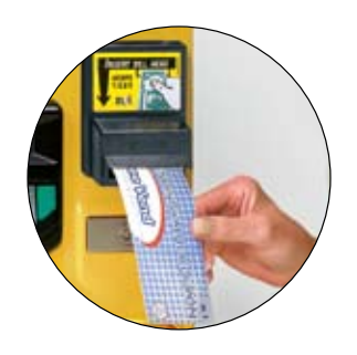
The MEI coupon program provides custom and generic coupons for free vends or dollar-value vends.

MEI Corporate Headquarters 1301 Wilson Drive West Chester, Pennsylvania 19380 1-610-430-2700 1-800-345-8215